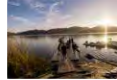
COVER PHOTO: LAUNCHING AT BRIONES. PHOTO BY ZACH FRANZEN

PHOTOS, EXCEPT THE STUDENT HEAD SHOTS, ARE BY ZACH FRANZEN